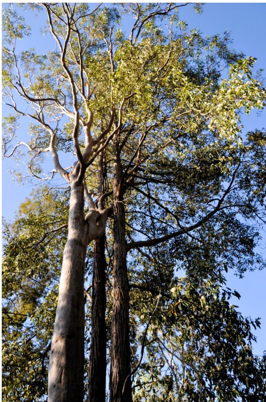
Gumtrees next to our Centre

Our 'Hare Street' Centre is located on the traditional homeland of the Dharug and Gundungurra people. We recognize and pay respect to the traditional custodians of country past, present and emerging.