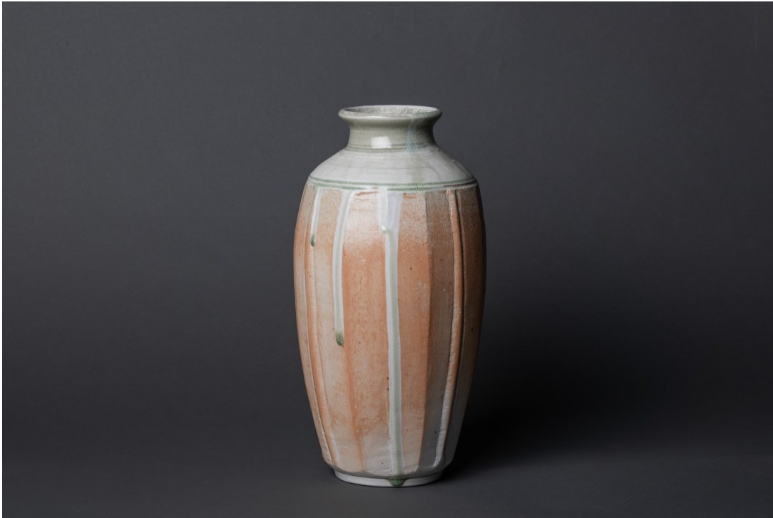
Geoff Crispin, Bottle , 2024, Porcelain, ash and celadon glazes, 31.5 x 14 x 14cm