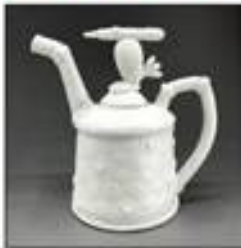
Lelene Trenga The Perfect Bird of Tulgey Wood