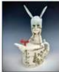
Fleur Schell The universe listens to the grave