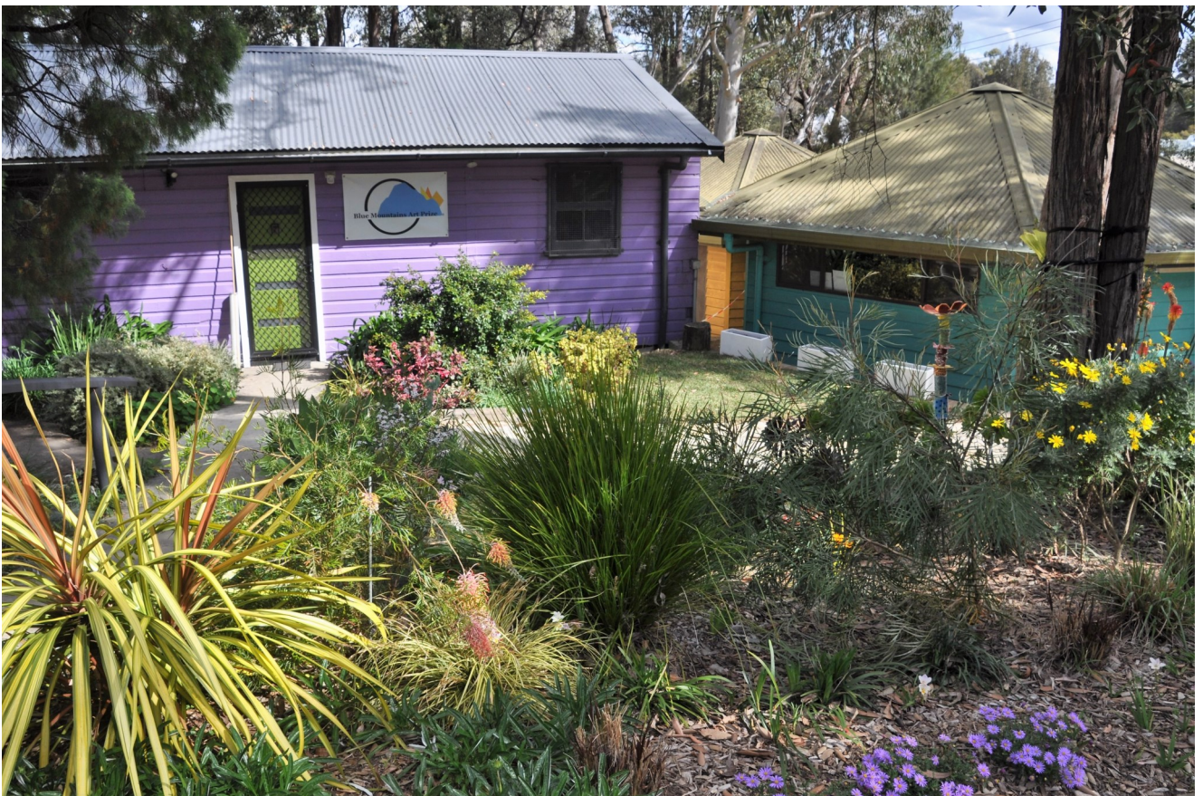
Spring flowers and unfurling leaves are surrounding the Hare Street Centre.