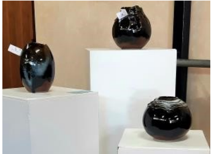
Tenmoku/chun glazed vases by Bronwyn