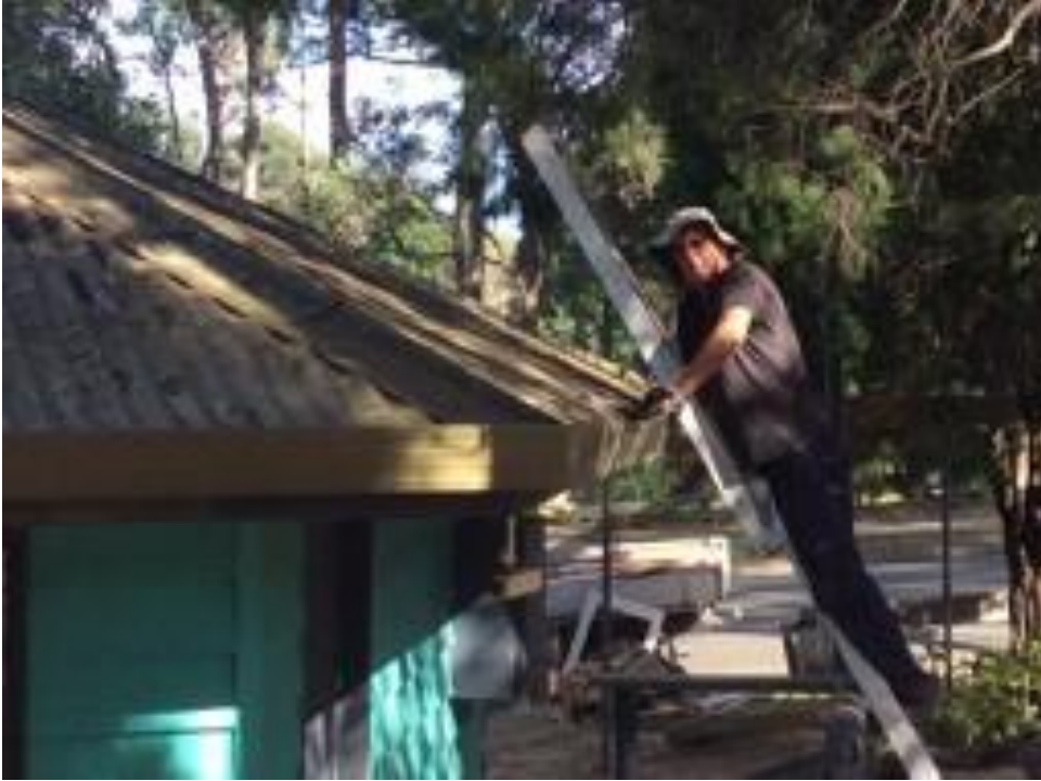
Clearing the gutters