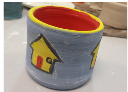
Yet to be glazed.