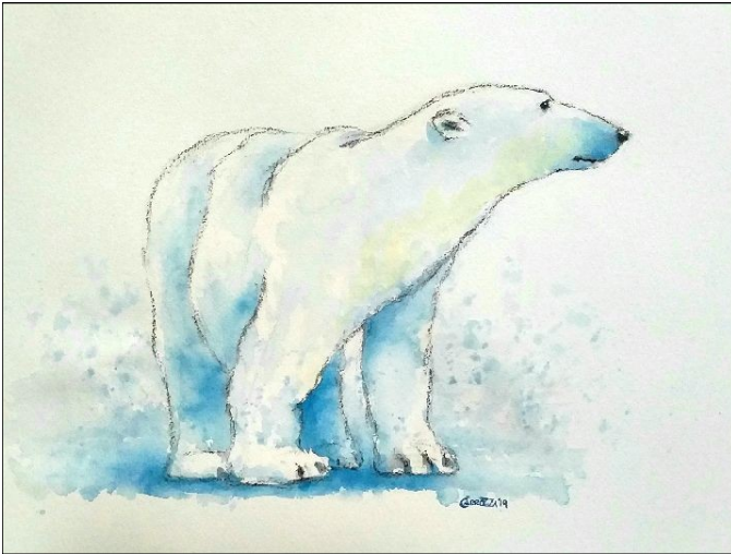
A beautiful water colour by Gus Carrozza.